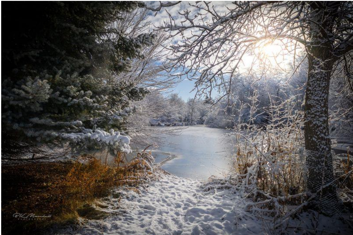
Winter Glory, North Idaho

Prayer requests will be revised periodically for space. Kindly keep the church office informed of changes. Thank you.