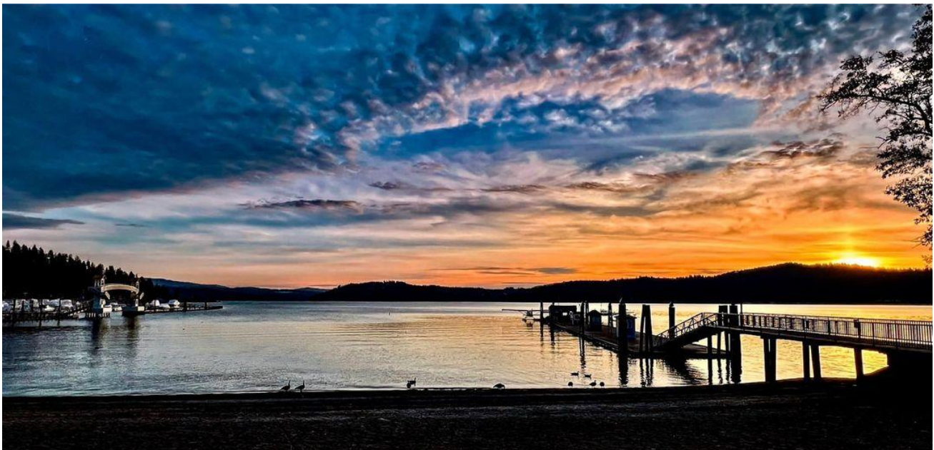
Lake Coeur d'Alene, Photo Credit: HuggyBear Photos

Prayer requests will be revised periodically for space. Kindly keep the church office informed of changes. Thank you.