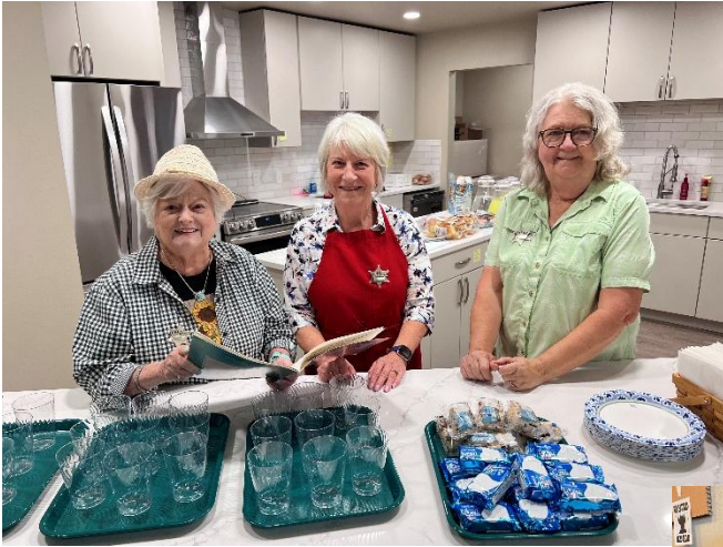
The Chuck Wagon Crew

First night... Our Yee Haw VBS is off to a bronc bustin' start!