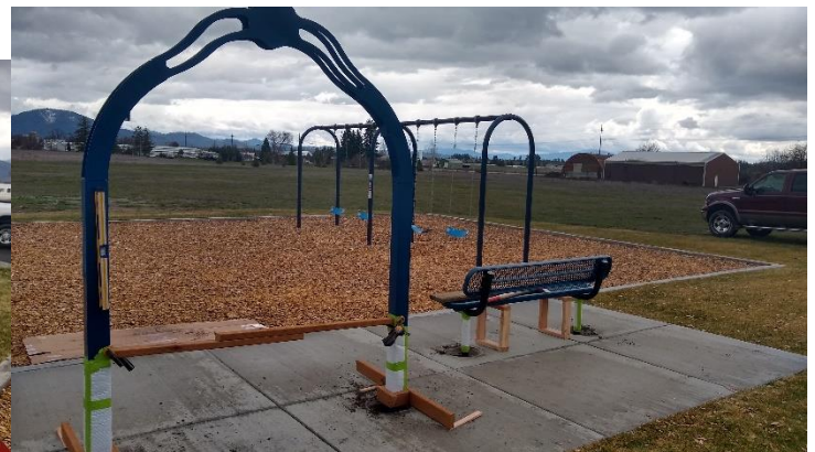
Who wants to swing?