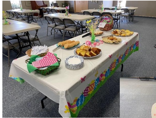
Beautiful fellowship table filled with Easter treats!