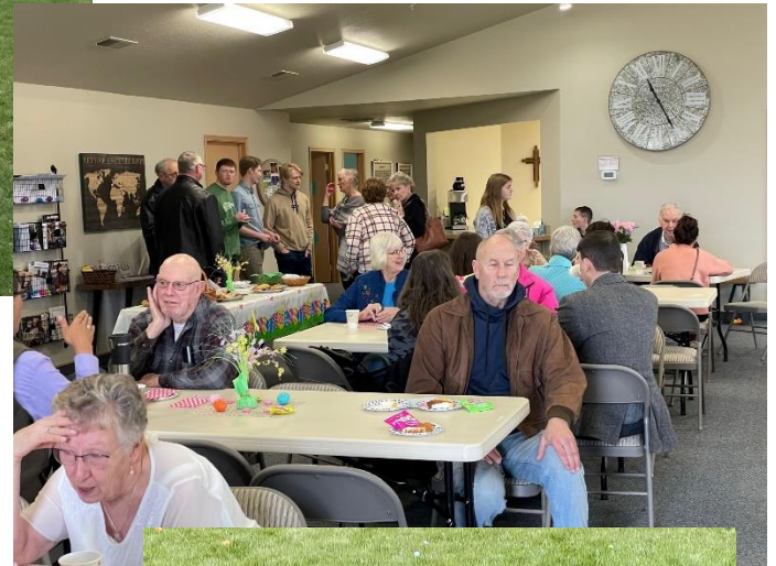
Thanks to Joy Brewer for these Easter pictures!