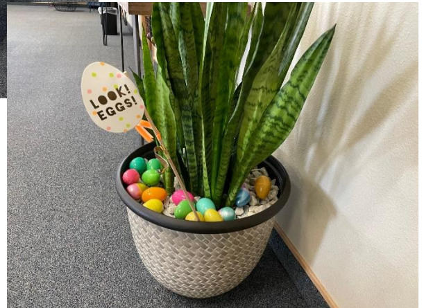
Look at them go! So many eggs!!