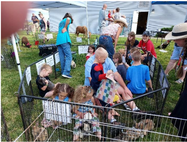
Bunnies, guinea pigs, banty & silkie chickens!