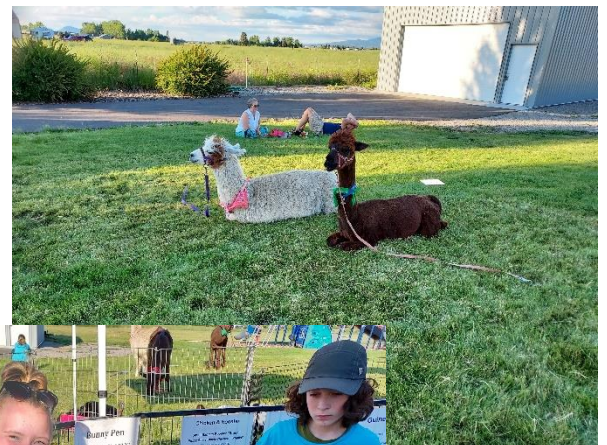
Llama, Alpaca, and humans all having a nice lie down!