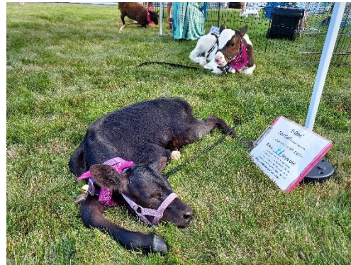
E-Dee, a sweet 11-day old calf having a snooze.