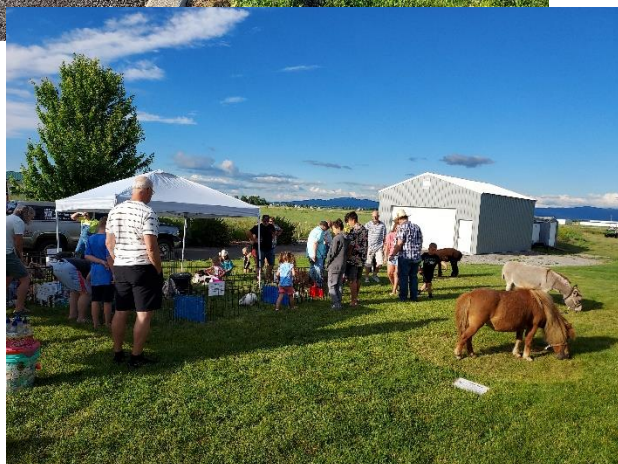
Miniature horse and a Jerusalem donkey (with cross on its back!)