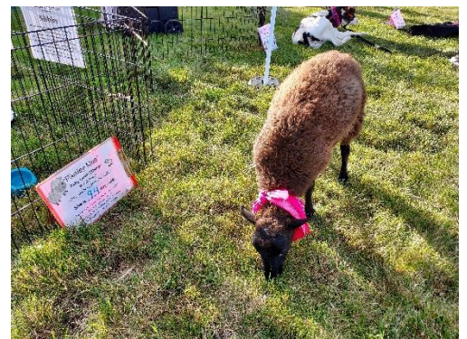
Paisley Mae, a baby lamb, so fluffy!