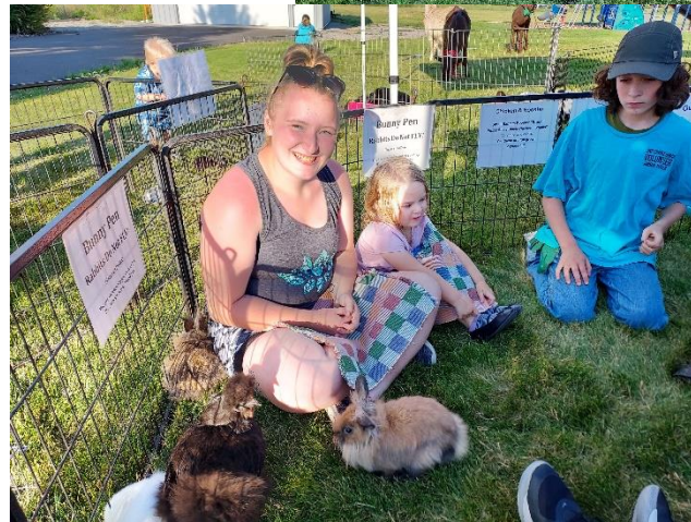
Even big kids like to pet the animals!